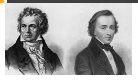
Beethoven and Chopin CSO will perform complete cycles of Beethoven overtures and Chopin concertos